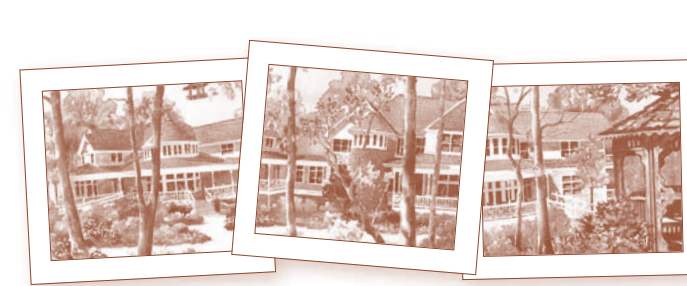
News from The Rathbun Center – Winter 2009