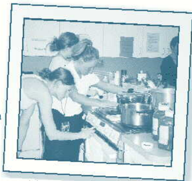
Asheville Buncombe Youth Council members cook a wonderful homemade spaghetti supper for our guests

Methodist Retirement Community Residents for donating dinner on Christmas Eve and to the the LaRowe Family for